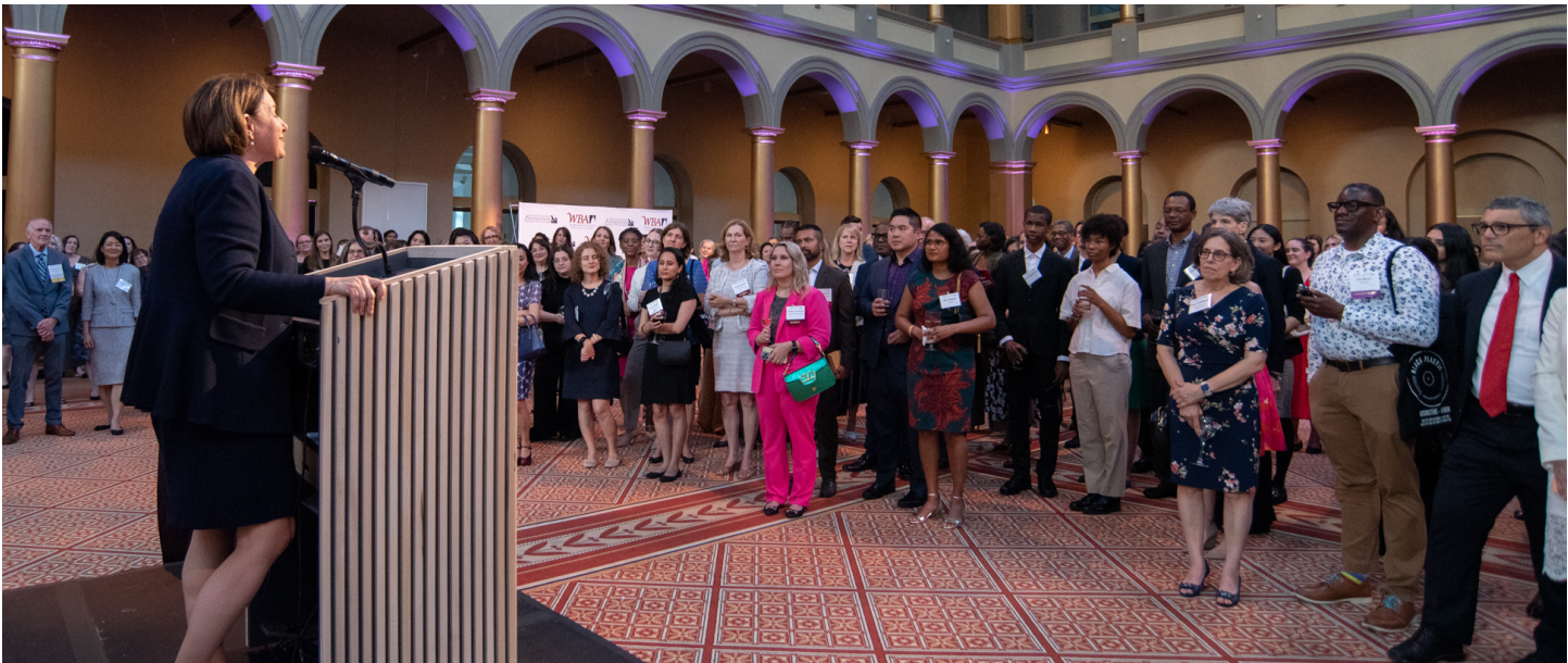
Sen. Amy Klobuchar addresses dinner attendees during the reception

Each year, the Foundation and the Women’s Bar Association jointly host their Annual Dinner at a festive gala. The event was held at the National Building Museum on May 22, 2024. Proceeds from the joint event support both the Foundation and the Association.