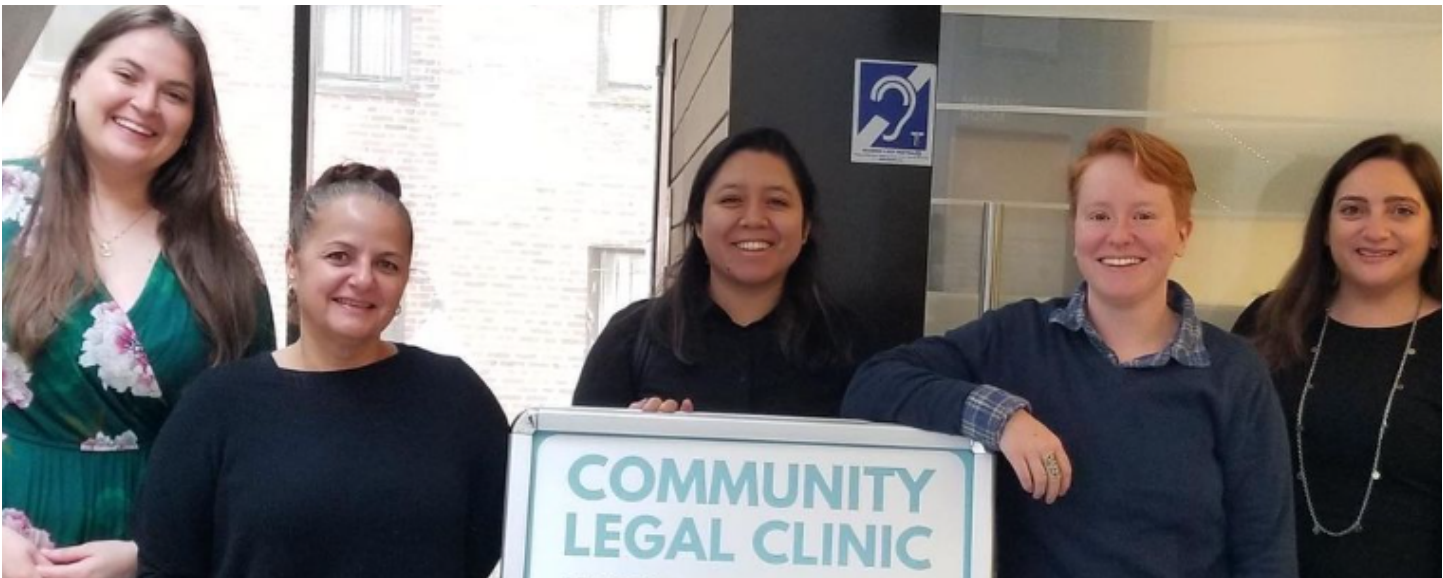
DCVLP began operating a new clinic location at Children’s, Shaw Metro location as part of its Medical Legal Partnership. Attorneys provide free legal consultations on domestic violence, family law, and immigration matters at the clinic.