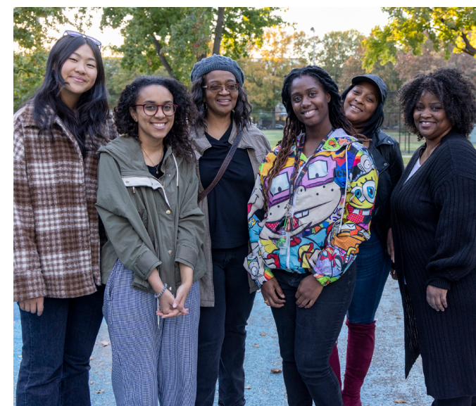
Mothers Outreach Network mom participants pose after a community outreach event at a James Creek DC Public Housing Community event.