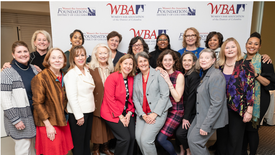
WBA and WBAF past presidents