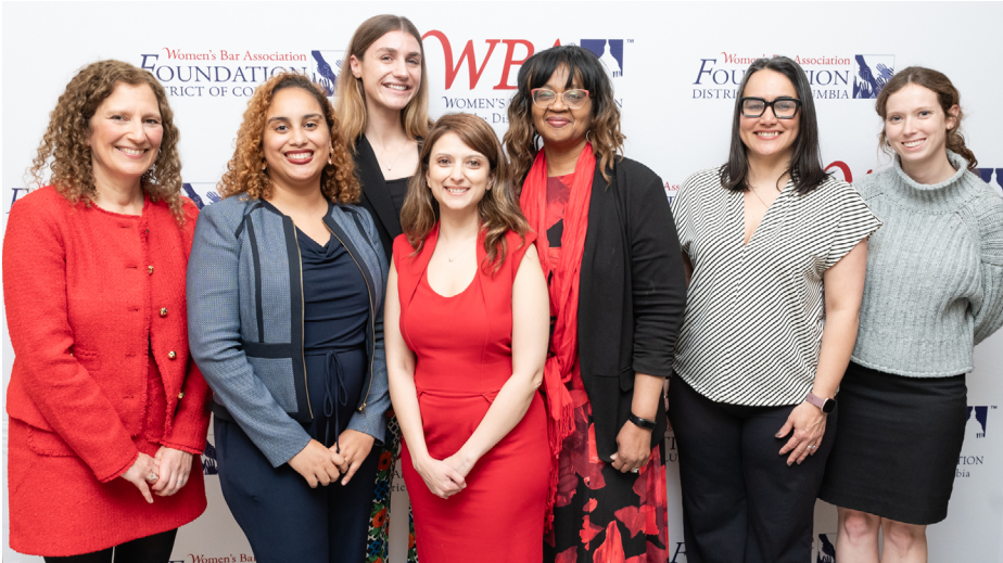
Representatives of the 2024 grantees

During the networking portions of the event, grantees, Foundation Board members, and Foundation supporters were able to meet each other and learn more about the missions of the Foundation grantees.