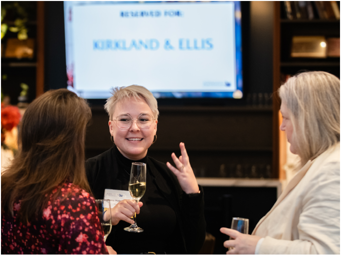
Attendees enjoyed a variety of wines, including a sparkling option to kick off the evening